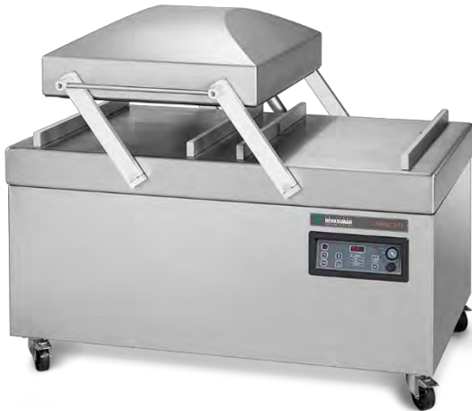
Optional without extra costs: 2 seal bars (left-right)